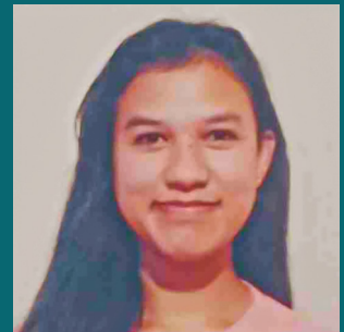
SANDAKMEN SYIEM 3 rd position, History