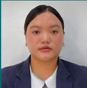
BARBOMCIE DUI 1 st position, BTTM