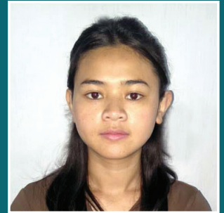
IBANRIKYNTI SUN 5 th position, Chemistry