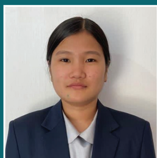
METING CHEDA 5 th position, BTTM